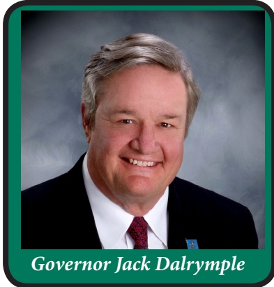
Governor Jack Dalrymple

Information for members and friends of Golden Growers Cooperative